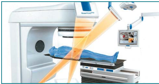
Image Guided Radiotherapy (IGRT) providing the highest precision radiotherapy available

*Amifostine radioprotection available for all treatment modalities listed.