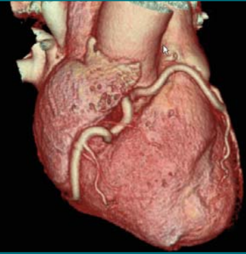
CTA coronary arteries via 64-slice VCT scanner

Imaging services are available 24 hours a day, 7 days a week. If you have general questions or need referral forms sent to your office, please call us at (631) 444-9575.