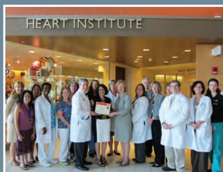
Stony Brook University Hospital Receives Gold Award for Treatment of Heart Failure Patients from the American Heart Association. May 2012

31 Main Road (Route 25), Suite 3 Riverhead, NY 11727