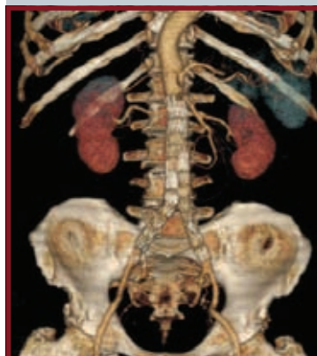
CT 3D Aorta Scan

Imaging services are available 24 hours a day, 7 days a week. If you have general questions or need referral forms sent to your office, please call us at (631) 444-9575.