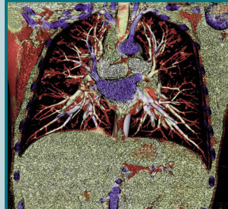
CT 3D Chest

Imaging services are available 24 hours a day, 7 days a week. If you have general questions or need referral forms sent to your office, please call us at (631) 444-9575.