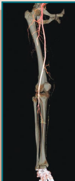
CTA Lower Extremity