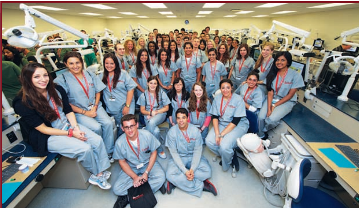
Pre-dental students at Stony Brook University School of Dental Medicine's inaugural Discover Dental School program.